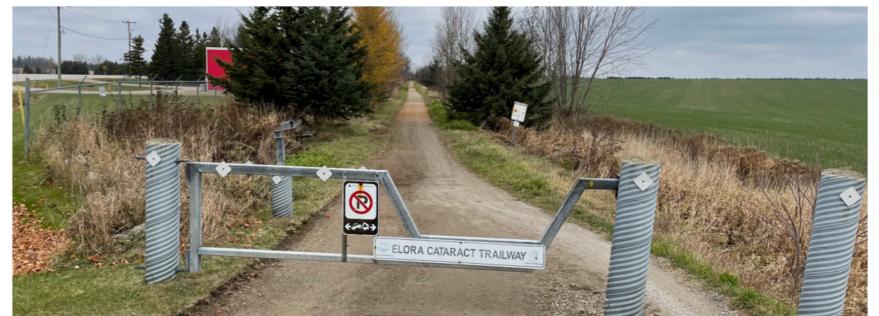
Photo Gate 9, November 17, 2024

Please consider donating to our ongoing trail-widening program. Please refer to our membership and donation information page.